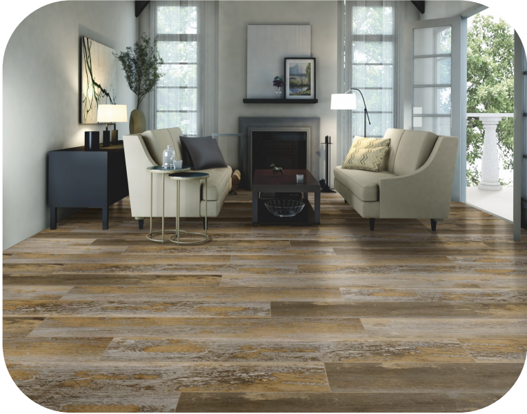
Vintage Harvest - 46201